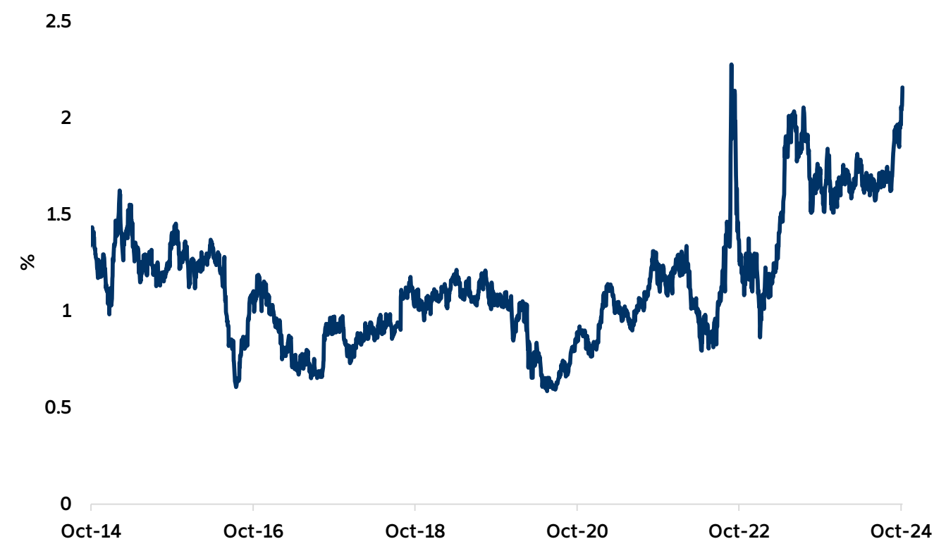
Yield spread between 10-year UK and 10-year German government bonds